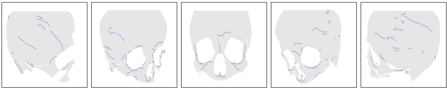
Fig. 1. From left to right: partial views of the skull and their corresponding crest lines acquired at 270^\circ , 315^\circ , 0^\circ , 45^\circ , and 90^\circ , respectively

For the semiautomatic approach, Yoshizawa et al.'s proposal [9] was considered to extract the crest lines. The original 270^\circ - 315^\circ - 0^\circ - 45^\circ - 90^\circ views comprise 109936, 76794, 68751, 91590, and 104441 points, respectively. After crest lines extraction, the reduction in size is important: 1380, 1181, 986, 1322, and 1363 points. Figure 1 shows the correspondence between crestlines and the most prominent parts of the skull in every view. In the automatic RIR approach, we have followed an uniform random sampling of the input images. Hence, the only parameter the forensic expert must consider is the density of this random sampling. We fixed a 15% of the original dataset as a suitable value for the time and accuracy tradeoff.